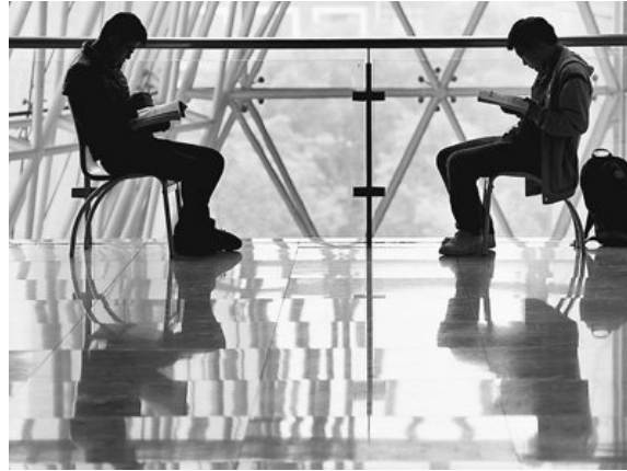
Figure 1 Change of knowledge information in one-way transmission