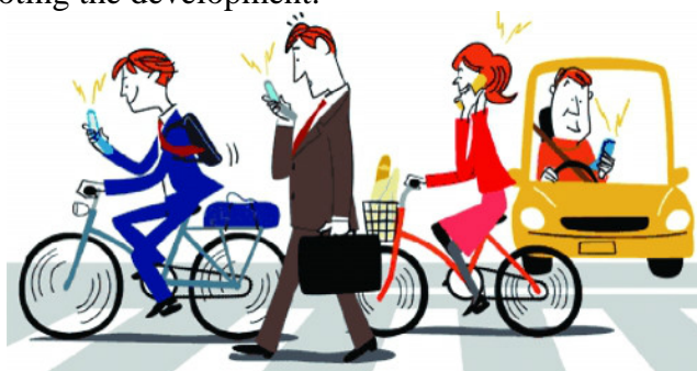
Figure 3 Access to knowledge information in the microage is not limited by space time